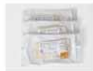
CWK-3 Abdominal Wall Closure Set Extension (3-pack) Qty: 1