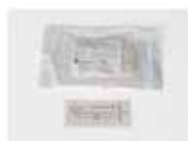
SWA07-20 Button Tails Qty: 20 (10 packs of 2)