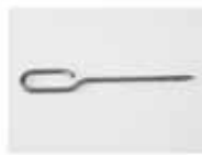
SWC01 ABRA Abdominal Cannulator Qty: 1