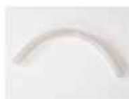
AWC01 Elastomer Retainer Qty: 1