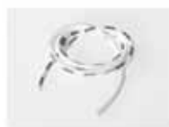
CZE07 Silicone Elastomer Qty: 10 (2 packs of 5)