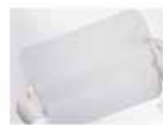
CWKSR-L* Southmedic Surgical Retainer (Large) (Die cut: 12 x 17 x 0.040") Qty: 1